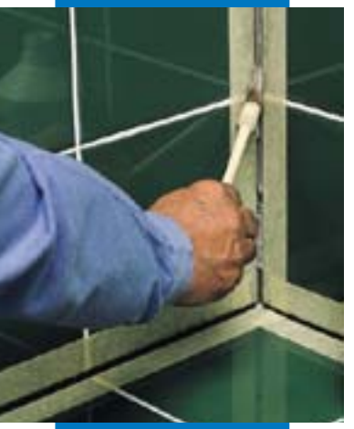
Application of Primer FD