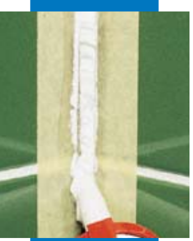
Application of Mapesil AC