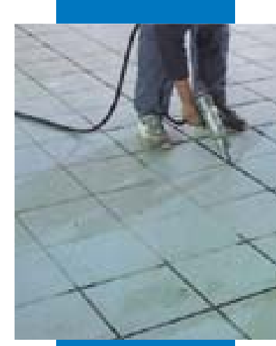
Sealing ceramic tile floor with Mapesil AC