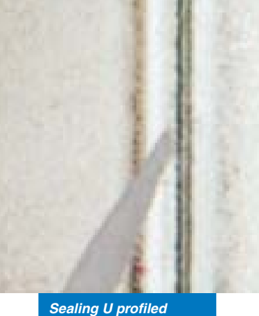
Sealing U profiled alass

Sealing of expansion joints or fitting different building elements in construction, with acetic-crosslinking coloured or transparent silicone sealant (e.g. MAPEI S.p.A. Mapesil AC or equivalent), which is able to absorb joint movements up to 20% of the width, after having first, if necessary, applied a fixing primer (e.g. MAPEI S.p.A. Primer FD or equivalent). The seal must be mildew-resistant and must remain unchanged even after many years of exposure to climatic extremes, industrial pollution, sudden temperature changes and immersion in water. A closed cell polyethylene foam cord (e.g. MAPEI S.p.A. Mapefoam or equivalent) must inserted into the joint.