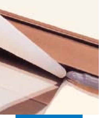
Sealing aluminium window frame with Mapesil AC

All relevant references of the product are available upon request.