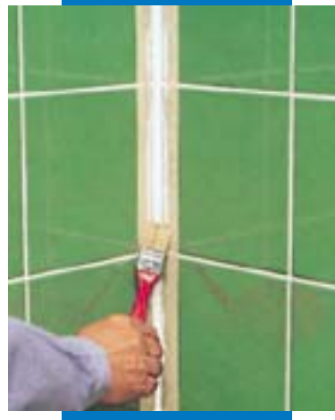
Smoothing the joint with soapy water and a small brush